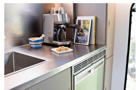
LEFT AND ABOVE Clever layout and simple but elegant decor; The beautiful Rimex stainless-steel internal kitchen